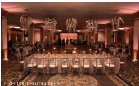
PIXEL POP PHOTOGRAPHY